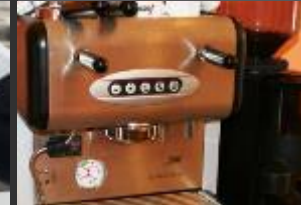
COFFEE MAKERS, BAR EQUIPMENT