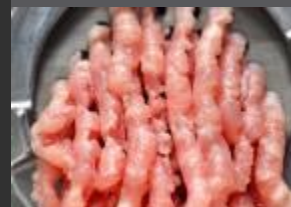
FOOD PROCESSORS, MEAT/VEGETABLE