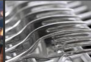
DISHWASHERS AND EQUIPMENT