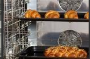
CONVECTION OVENS BLAST FREEZERS