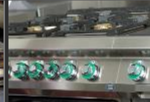
600, 700, 900 LINES