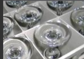
DISHWASHERS AND EQUIPMENT