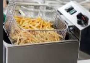
SMALL TABLE EQUIPMENT