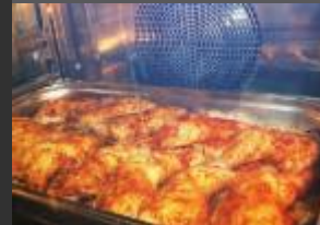
CONVECTION OVENS BLAST FREEZERS