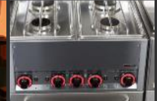
600, 700, 900 LINES