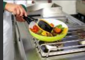
DROP-IN COOKING CENTRES