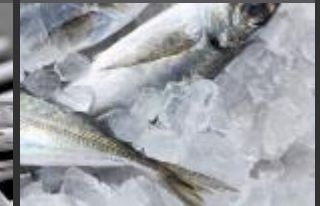
COOLERS, ICE MAKERS