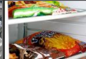
COOLERS, ICE MAKERS