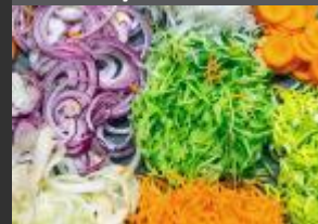
FOOD PROCESSORS, MEAT/VEGETABLE