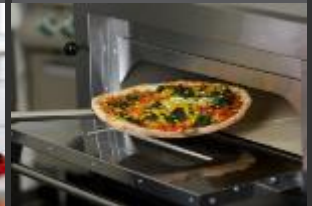
EQUIPMENT FOR PIZZERIAS